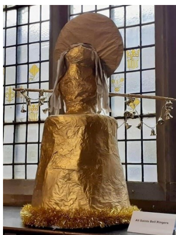
All Saints' Bellringers