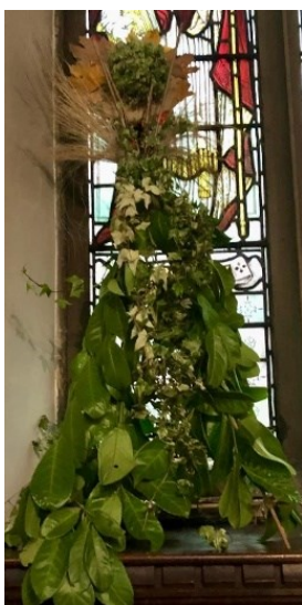
All Saints' Gardening Group