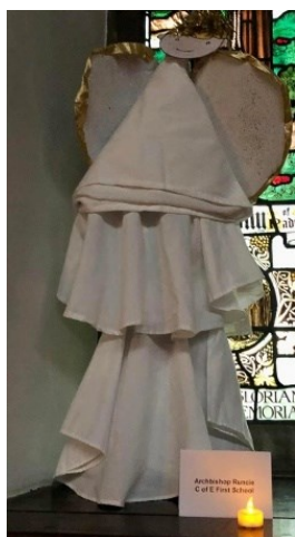
Archbishop Runcie First School