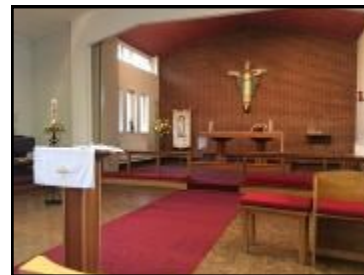
St. Hugh's Church, Gosforth