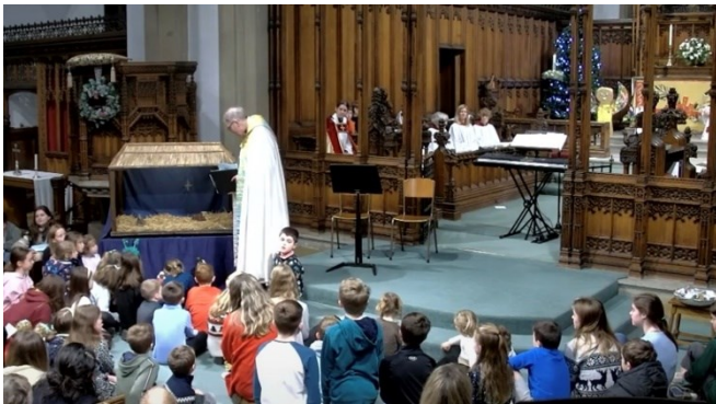
Children helping to bless the crib at the 4.00 service.