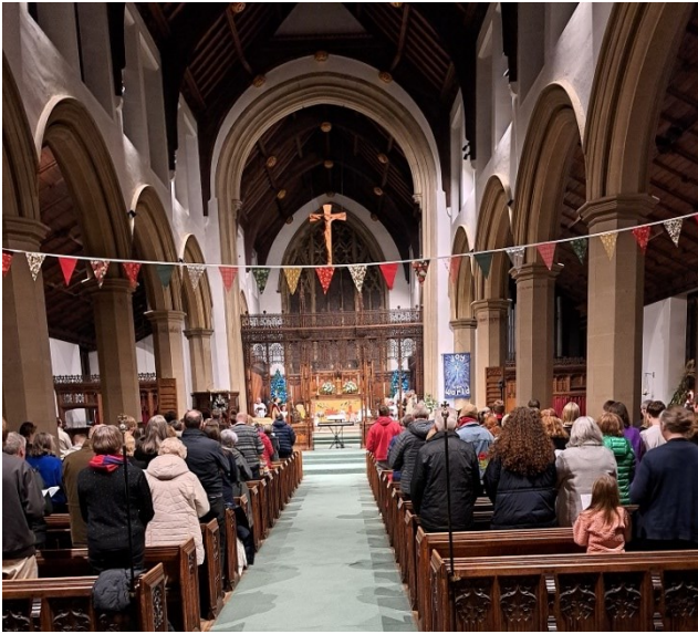
A full church for the 6.30 Carol Service