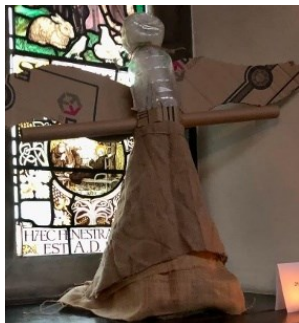
21st Newcastle Brownies