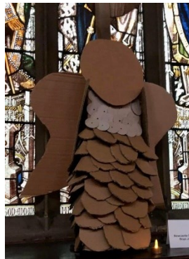
Newcastle School for Boys Juniors

There were some practical problems with how to get an angel to stand upright — unlike a Christmas tree, an angel doesn’t sit in a pot! People rose to the challenge, however, and came up with some quite ingenious designs: angels on a frame, angels hung from Christmas trees, even an angel built over a