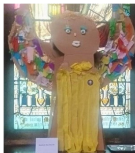
Gosforth Sea Scouts